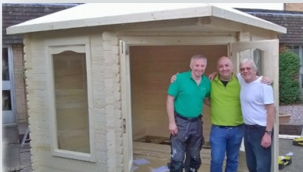
Members erect a new summerhouse at Hewlett Court

The future does look that it is getting rosier and the Festival concludes in October of this year (2015); then the ELMC can look forward to claiming back its rightful place in our Masonic Charity organisation.