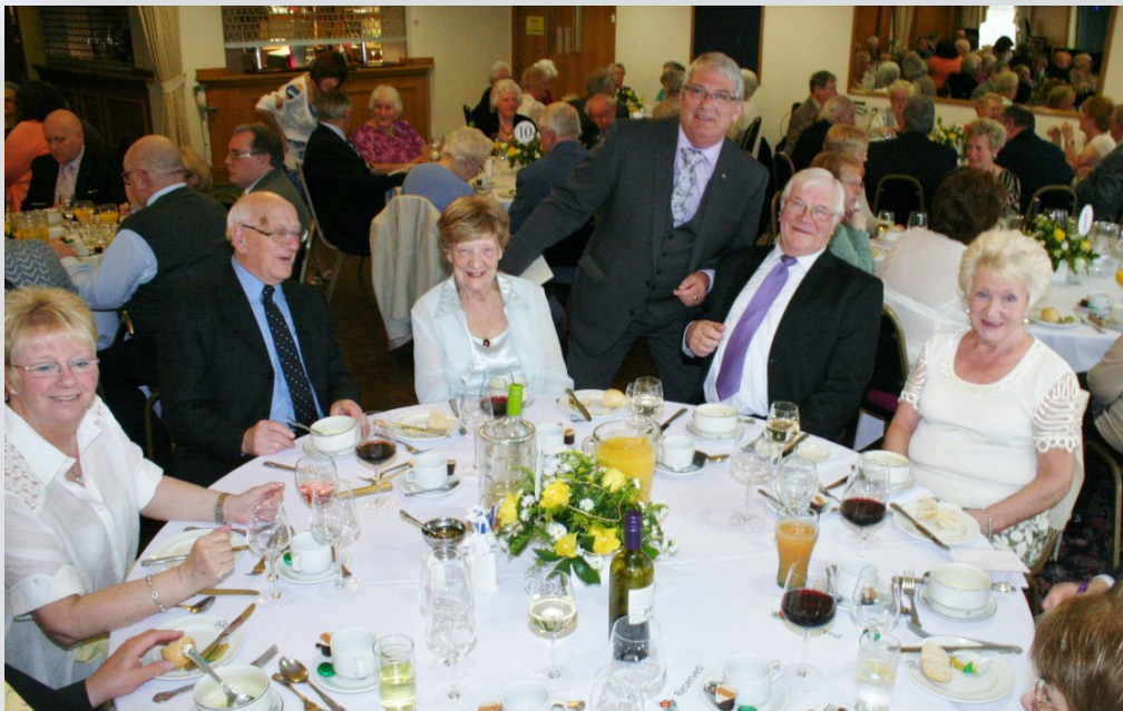
ELMC Spring Party for its Beneficiaries

The Community Fund Committee will continue to receive, consider and make grants to Non Masonic Charities throughout 2015 but with the planned completion of the EL 2015 Festival for the RMBI the future activities and operational guidelines of this committee will be reviewed and planned for 2016.