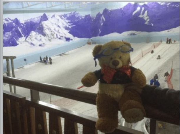
Fun at the Chill Factore